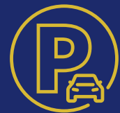
FREE PARKING ON SITE