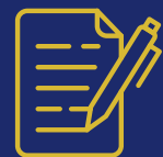
FREE WILL WRITING SERVICE

Staff can work across our family of schools, enabling our academies to benefit from wider expertise and to offer individuals fresh opportunities. Quality of life outside work significantly shapes the way in which people perform, so the need to achieve a healthy work/life balance is an important aspect of our commitment to staff.